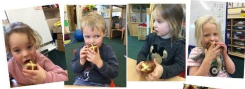
29.3.22 We made hot cross buns in YN and YR.